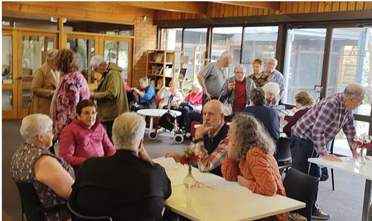
Waiting in the foyer, part of the eager crowd.