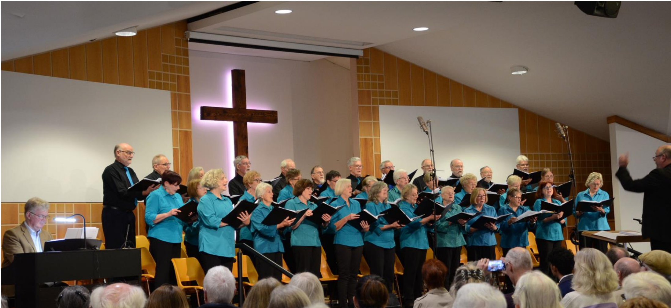
Opening item : "ABBA FOREVER"