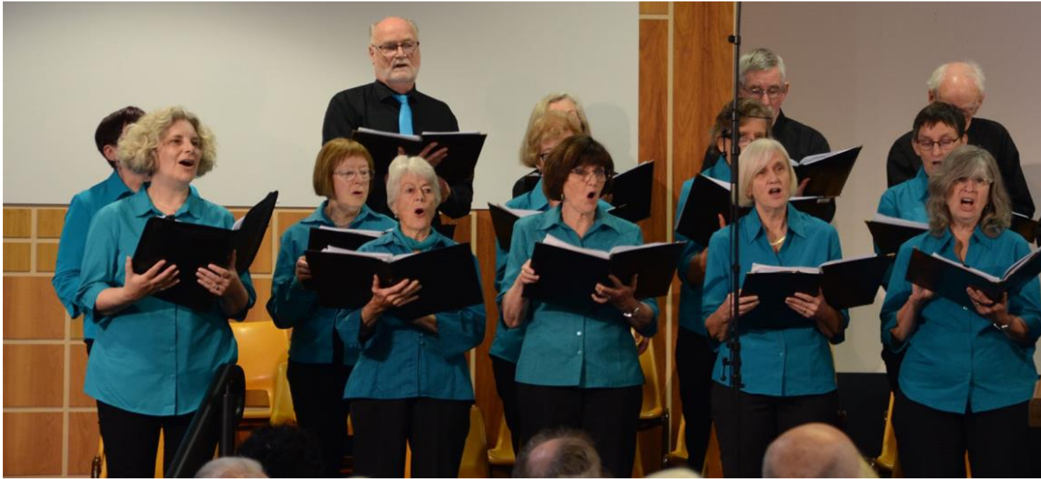
At the left hand side of the choir, the sopranos and tenors waxing lyrical, and watching the Music Director!